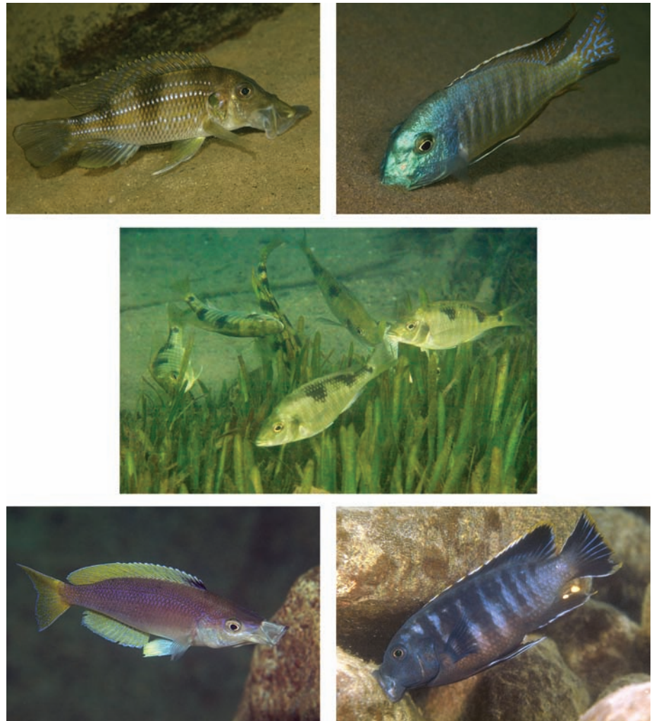
Fig. 2. Adaptive diversification in cichlids. Several examples of cichlids that use different habitats. (Upper left) Gnathochromis permaxillaris occurs in the deeper (>35 m) intermediate (rock-sand interface) habitat with sediment-rich bottoms in Lake Tanganyika. (Upper right) Lethrinops furcifer is found in sandy environments near beaches in Lake Malawi. (Center) Hemitilapia oxyrhynchus , which is found in shallow vegetated habitats in Lake Malawi. (Lower left) Cyprichromis sp. "Leptosoma Jumbo" (Nkondwe) occurs in open water in Lake Tanganyika. (Lower right) Petrotilapia nigra occurs in the upper part (>10 m) of the sediment-free rocky habitat of Lake Malawi.

This hypothesis is mostly based on generalizations from the mathematical theory of speci-